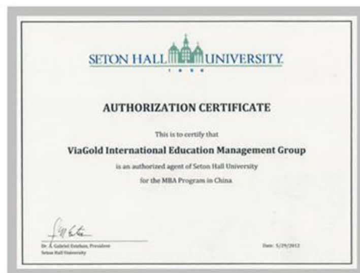
《授权书》内容：兹授权金网国际教育管理集团为美国西东大学MBA项目中国地区总代理 Authorization Certificate, This is to certify that ViaGold International Education Management Group is an authorized agent of Seton Hall University for the MBA Program in China.